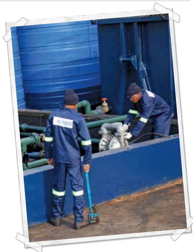
Waste collection, transportation and disposal

Interwaste's business activities, conducted under the Interwaste, Envirowaste, Greens and Industrial Cleaning brands, include the collection and disposal of waste, management of the environmental consequences of the waste, landfill management and ownership, the development and implementation of alternatives to landfill disposal, the production of organic compost and related products, metals recovery, where required as part of the service to our clients, water and sewerage treatment and specialised industrial cleaning. Interwaste operates in South Africa and a number of its neighbouring countries.